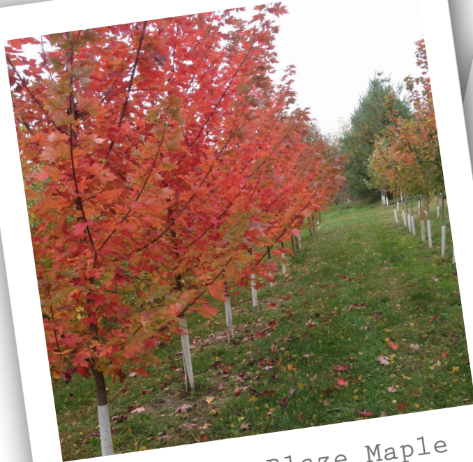
Autumn Blaze Maple

www.FrazierNursery.com 319-472-2649 Vinton, IA